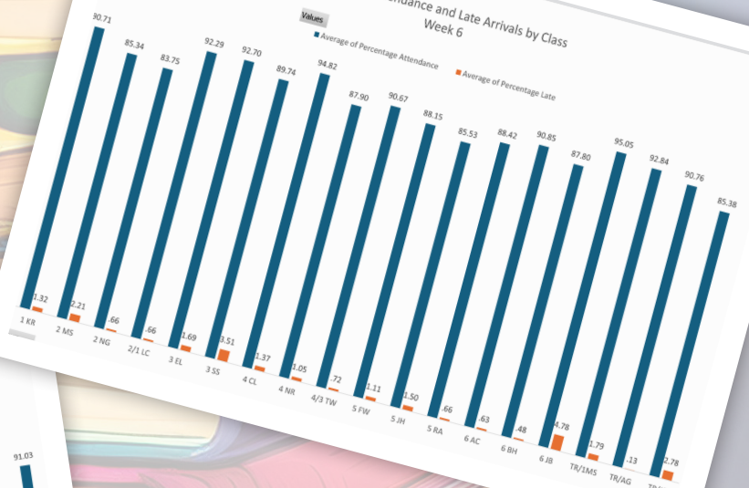
Average Attendance and Late Arrivals by Class Week 6