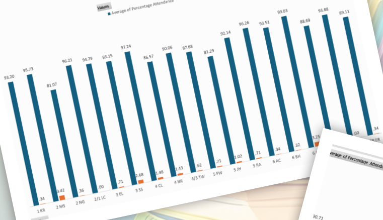
Average Attendance and Late Arrivals by Class Week 3